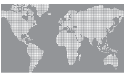
The HYTORC Universe is made up of over 1,000 trained bolting specialists to support your bolting needs in over 100 countries.

With over 50 years of experience focused entirely on developing the highest quality industrial bolting systems, HYTORC remains committed to higher performance and service and offers superior technology, quality, and support.