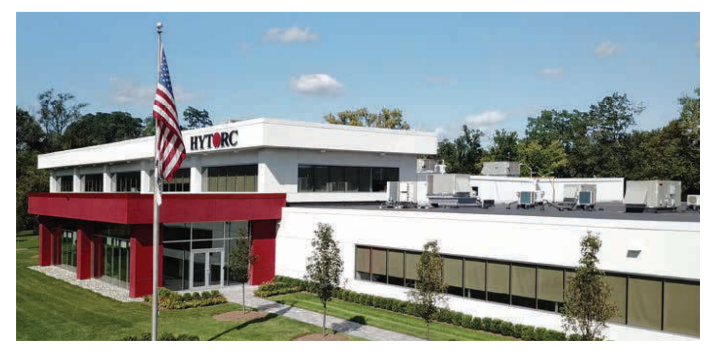
HYTORC MISSION STATEMENT

HYTORC'S MISSION IS TO OPTIMIZE SAFETY, QUALITY AND SCHEDULE IN INDUSTRIAL BOLTING THROUGH INNOVATIVE SOLUTIONS, AND AN UNYIELDING COMMITMENT TO WORLD-CLASS CUSTOMER SERVICE.